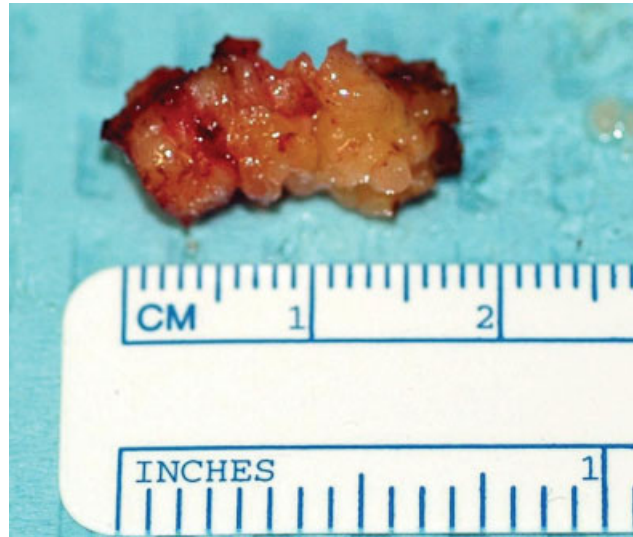
FIGURE 2. Representative sample of intact breast lesion removed during biopsy with the Breast Lesion Excision System with a 10-mm wand. Sample was approximately 18 mm in length.

A retrospective review was performed of 742 consecutive breast lesions with microcalcifications classified as BIRADS IV or V using the Breast Imaging